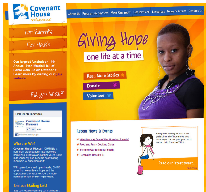
A great website example from Covenant House Missouri